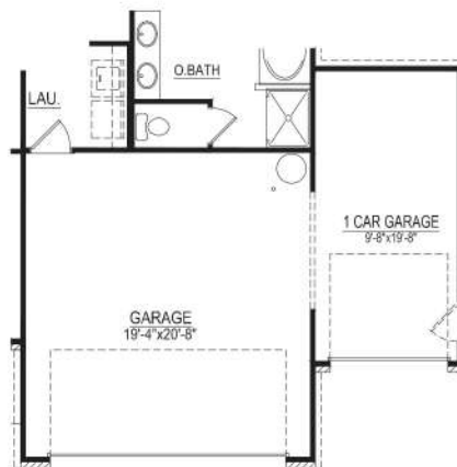
Optional 3rd Car Garage

In the interest of continuous improvement and to meet everchanging market conditions, the Builder reserves the right to modify the plans, specifications and products without notice obligation. All dimensions and/or square footage representations are approximate and subject to change without notice obligation. This is the artist's conception with optional shutters, gutters, brick work, and landscaping shown and should not be relied on as actual elevations and floor plans. Refer to Builder specifications for your particular subdivision.