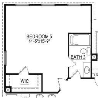
Optional 5th Bedroom