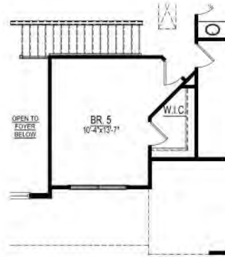
Opt. Bedroom 5