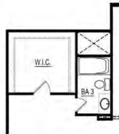
Opt. Bath 3