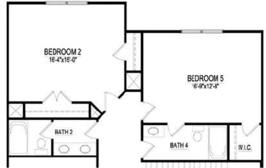
Optional Bedroom 5 w/ Bath 3