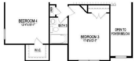
Optional Bath 3