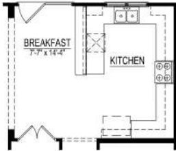
Optional Peninsula Kitchen