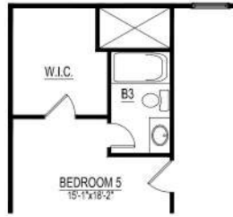
Optional Bath 3