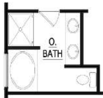
Opt. Owner Bath Upgrade