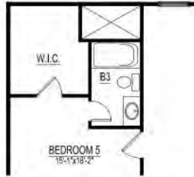
Optional Bath 3