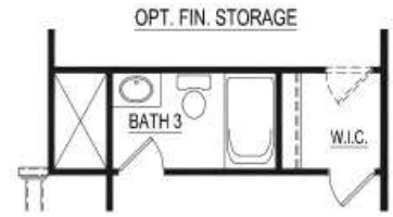
Opt. Bath 3