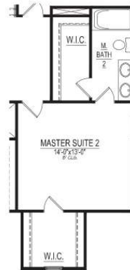
Opt. Master Suite 2