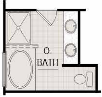
Opt. Owner Bath Upgrade