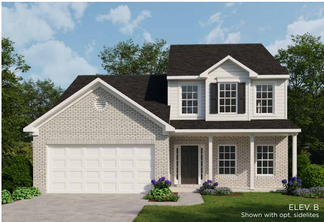
ELEV. B Shown with opt. sidelites