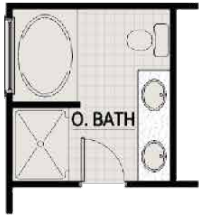
Owner Bath Upgrade