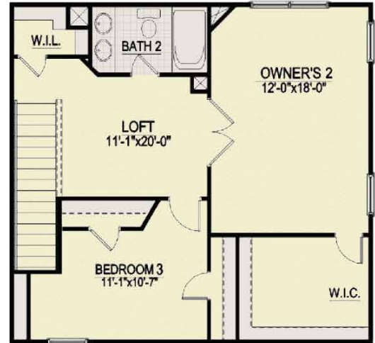
Second Owner Upgrade