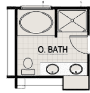
Opt. Owner's Bath