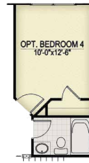
Opt. Bedroom 4