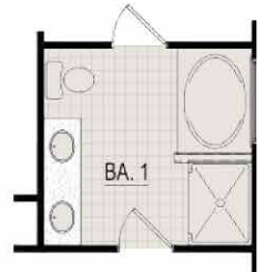
Optional Bath Upgrade