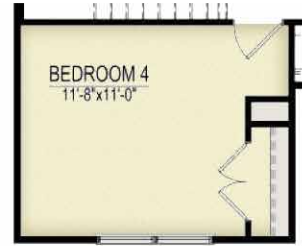
Optional Bedroom 4